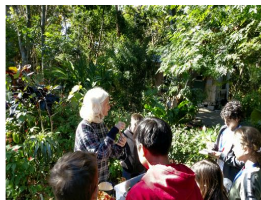
Gardening Basics 101