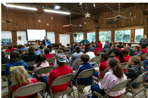
Everybody getting excited about gardening