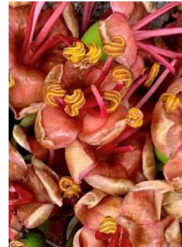
Ceiba pentandra Kapok Tree