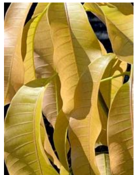
Mangifera indica 'Florigon' Mango