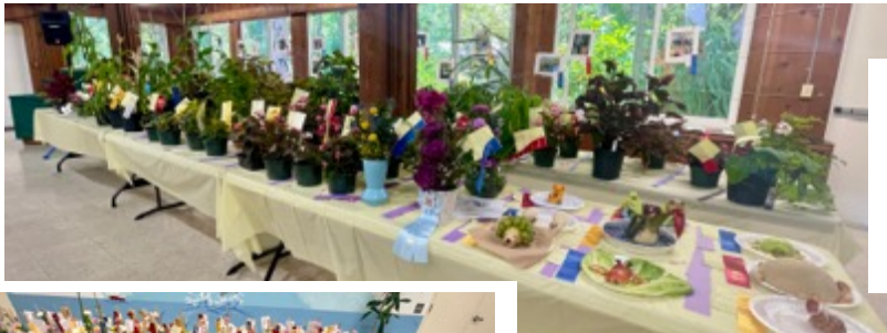
Left: BFF (Middle and High School) students entered a variety of categories that were judged and awarded appropriate ribbons for their efforts. The BFF Show was held at the Glenn F. Bates Garden Center.