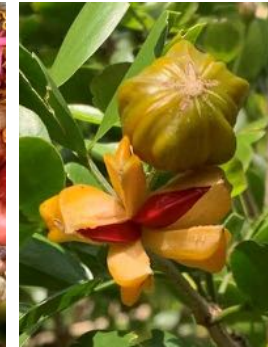
Guaiacum sanctum Lignum vitae