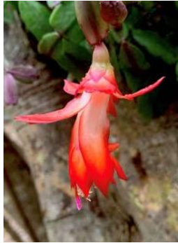
Schlumbergera spp. Christmas Cactus