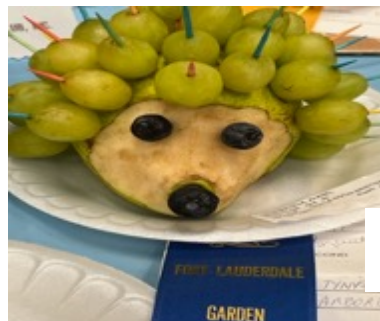
Left: A creative “whimsical” design at Harbordale made of fruit