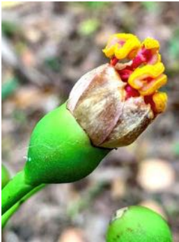
Ceiba pentandra Kapok Tree