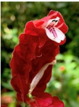
Justicia brandegeana Shrimp Plant