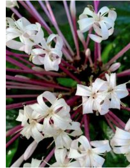
Clerodendrum quadriloculare Starburst