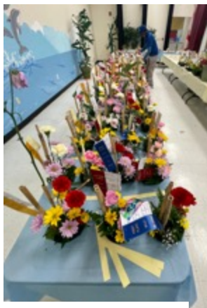
Above: Harbordale Student Designs