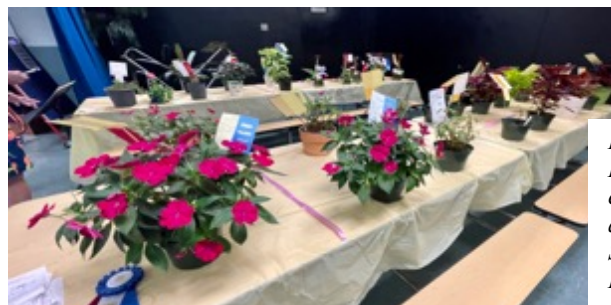
Below: Horticulture entries on display at Virginia Shuman Young Elementary