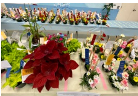
Above: Harbordale students entered both horticulture and design entries at their “in-school” Flower Show