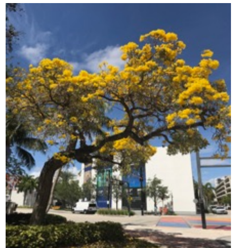
The Annie Beck Tree