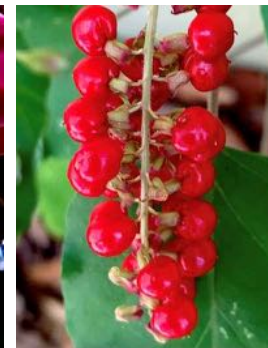
Rivina humilis Bloodberry