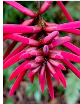
Erythrina herbacea Coral Bean