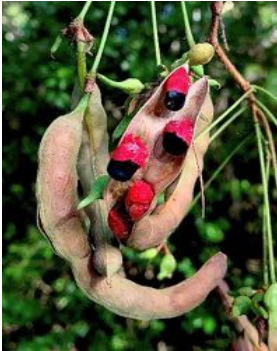
Pithecellobium spp. Blackbead/Cat's Claw