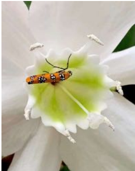
Eucharis grandiflora Amazon Lilly Ailanthus Webworm Moth