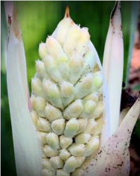
B. Aechmea Mexicana