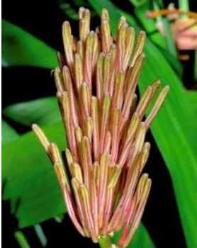
Dracaena thalioides Lance Dracaena