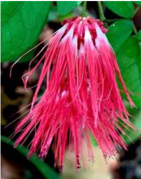
Calliandra tergemina - Powder Puff Shrub