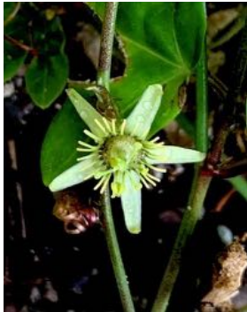
Passiflora suberosa Corksystem passionflower