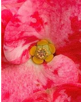
Euphorbia milii Crown of Thorns