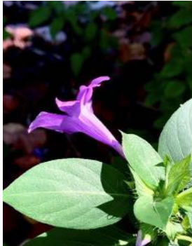
Barleria cristata L. Crested Philippine Violet