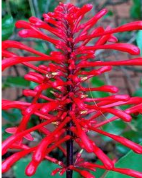
Odontonema strictum Firespike