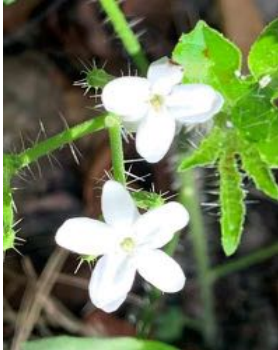
Cnidoscopus stimulosus Bull Nettle