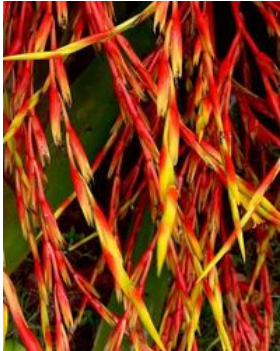
B. Aechmea blanchetiana